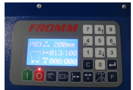
Easy to operate control panel